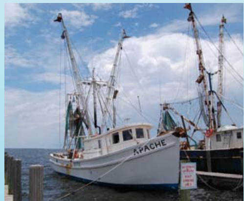
Shrimp Boats Docked Behind Andy's

FRY THE BACON. REMOVE BACON TO DRAIN. ADD ONION, PEPPER, CELERY AND GARLIC TO BACON DRIPPINGS. COOK UNTIL TENDER (DON'T BROWN); ADD UNDRAINED TOMATO, PARSLEY, SALT, PAPRIKA, RED PEPPER, BAY LEAF AND STOCK. BRING TO BOIL. REDUCE HEAT, COVER AND SIMMER. THICKEN IF NECESSARY WITH FLOUR/WATER. STIR IN SHRIMP, COOK A COUPLE OF MINUTES. SERVE OVER RICE. GARNISH WITH PARSLEY.